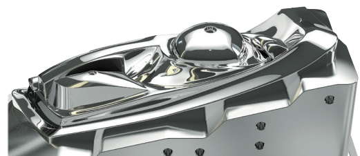
A highly polished mould for production of car headlights.

The properties are representative of samples taken from the centre of bars with dimension 596 x 296 mm unless otherwise is indicated. Values of different mechanical properties depend on dimension of original material, position and direction of samples as well as hardness and test temperature.